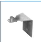
AT0820 wall mounting bracket (set of 2)