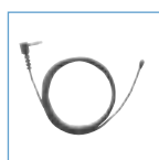
AT0529A transmitter antenna