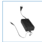
040-7402-106 power supply cord