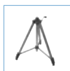
AT0824 speaker floor stand