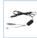
300-6332-107 aux-in cable for external audio (3.5mm–dual RCA)