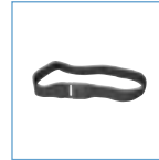
AT0712 921T elastic waist belt