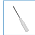
330-3000-101 channel changer screwdriver