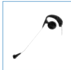
AT0814 earhook microphone ★★★★