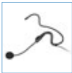
AT0655 behind-the-neck microphone ★★★★