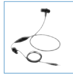
AT0816 FM collar microphone with mute switch ★★★