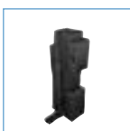
AT0822 carrying bag with shoulder strap