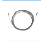
AT0532-05 auxiliary output/ input cable (5ft/1.5m)