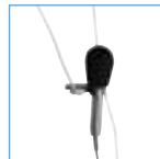
AT0291-L directional microphone with lavalier cord ★★