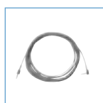
AT0532-15 auxiliary input/ output cable (15ft/4.6m)