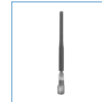
AT0831 920SR speaker antenna