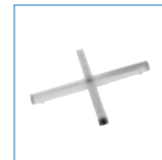
AT0823 speaker table stand